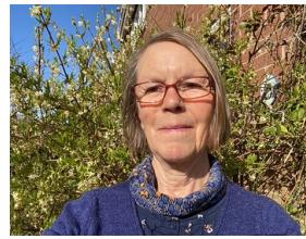
Judy Ashton Foundation Governor Safeguarding Lead