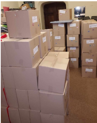
Some of the Christmas Hampers that the 'Foodbank Angels' put together for local families.

All this is only possible because of the generous donations of food from so many people in the area, and the dedicated work of many volunteers.