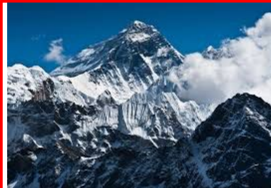
Mount Everest - one of the tallest mountains in the world

Single-use plastics are used only once before they are thrown away or recycled. These items are things like plastic bags, straws, coffee stirrers, water bottles and most food packaging